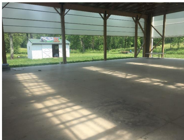
Cement floor with access to electricity