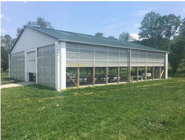
Fully enclosed lockable, weatherproof pavilion

Set up will be inside the pavilion. This is a fully enclosed pavilion with electricity and a cement floor. It is completely weatherproof with walls that can be moved up and down to let in light/air and locked at night. No need to bring a tent or worry about the elements! Your set-up space will be clearly marked for you in chalk on the pavilion grounds. Vendors are responsible for their own set up, staffing, tables, chairs, display pieces etc. Visit Honeybee Home's website for more information on the tag sale and additional photos. www.honeybee-home.com